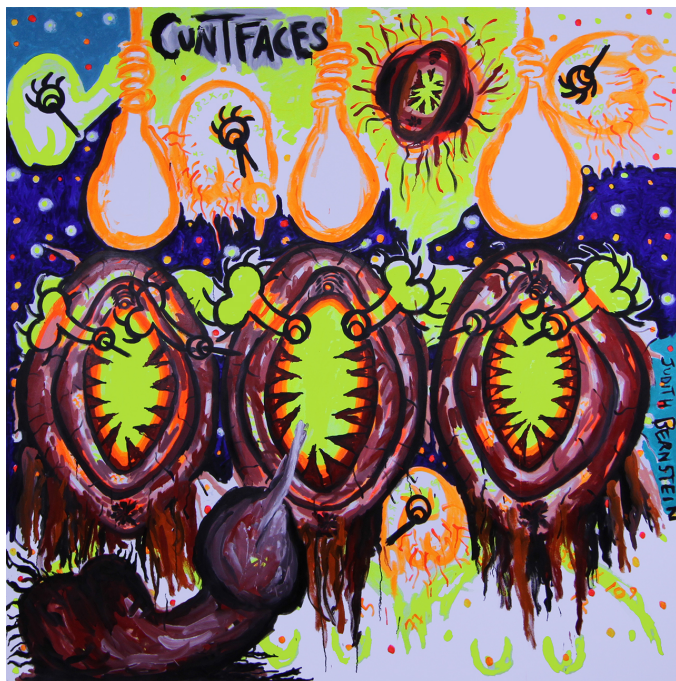
Judith Bernstein, “Cuntfaces” (2015), oil on canvas, 84 x 84 in (click to enlarge)

The new paintings do not disappoint. “The Voyeur” (2015), a massive, seven-by-seven foot painting, shows an abstractly drawn, central cunt image, surrounded by caricatured penises, sperm, and testicles. In “Crying Cuntface” (2014), a cunt-faced figure with penis-head eyes cries; in “Cuntfaces” (2015), three bloody vagina dentatas are arranged side by side above a semen-spewing penis, and below three boxing speed bags.