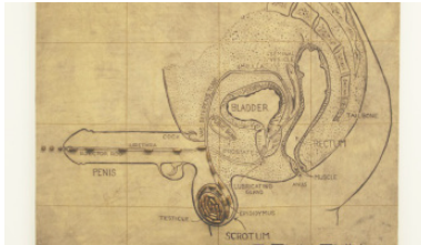
Big, Bigger, Biggest: Judith Bernstein Breaks Through