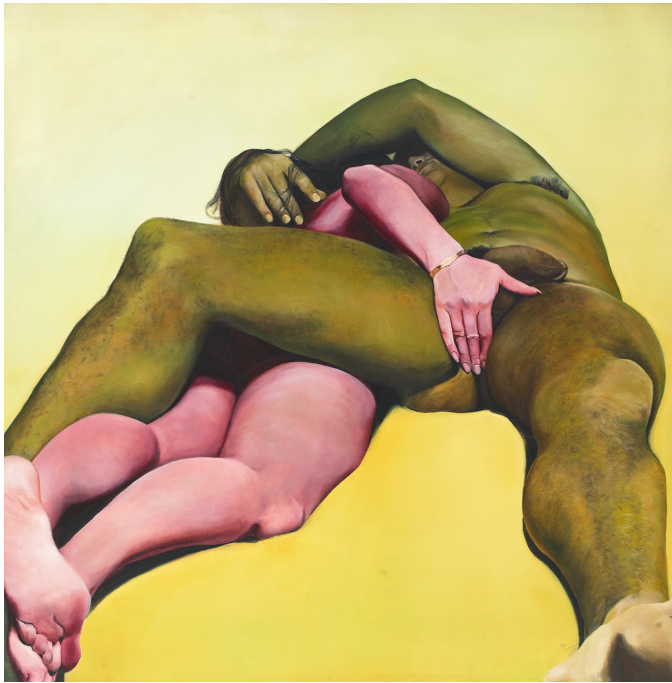
Joan Semmel, "Erotic Yellow" (1973), oil on canvas, 72 x 72 in (courtesy the artist and Alexander Gray Associates, New York, © 2015 Joan Semmel / Artist Rights Society [ARS], New York) (click to enlarge)

There are also examples from her Sex Paintings and Erotic series on view, including an untitled work (1971) depicting a woman receiving oral sex from a man — but from her perspective, which unseats the all-too-common male gaze. Semmel's preoccupation with the gaze itself as a mechanism of power is also evident in "Erotic Yellow" (1973), which portrays a reclining, embracing couple, the woman holding the man's testicles. The sharp color contrasts — a brown male body, a pink female body, both set against a bright yellow background — and the skewed perspective produce a stunning image of hetero-eroticism, and one in which the female is not solely the object of male desire but rather an equal participant. This work, like many others from the 1970s, is an autobiographical self-image testifying to a liberated female sexuality.