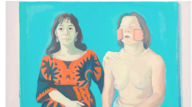
Maria Lassnig in New York, 1968–1980