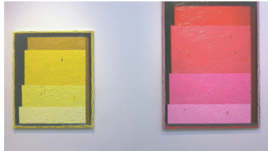
The Pursuit of Art, 2014

Ida Applebroog: The Ethics of Desire will open at Hauser and Wirth (511 W 18th Street, Chelsea, Manhattan) on May 14.