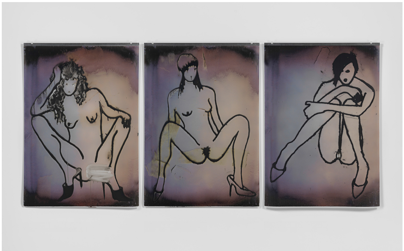
Ida Applebroog, "Ethics of Desire" (2013), ultrachrome ink on mylar, 3 panels, 59 3/4 x 128 3/8 in

So, what can we make of the coincidence that there are several exhibitions right now featuring the work of second-generation feminist artists? This isn't, of course, to say these women haven't been showing all along — they have, just not at the same time. Are we experiencing a revival of interest in feminist art — or are galleries getting pressured to show more women? Is the art world just now catching on that these women are here and still producing stellar, and more importantly prescient , work — the golden age of the " overlooked female artist " — or is this a bad sign, given that the fall is reserved for the so-called heavy-hitting artists? I'm left to wonder why all these women are being squeezed into the end of spring and early summer, alongside group shows, when there is the least gallery traffic and very few sales. But maybe a coincidence is just a coincidence. Regardless, it's bound to be revelatory for New York art audiences who haven't had firsthand access to this work before. Let's hope this is the first of many such coincidences — and that next time, it happens in the fall.